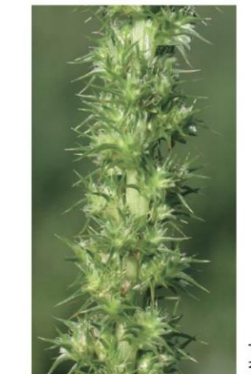
Palmer amaranth spiny female inflorescence