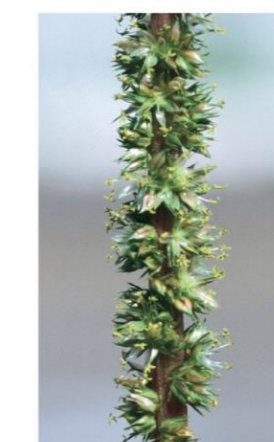
Palmer amaranth male inflorescence