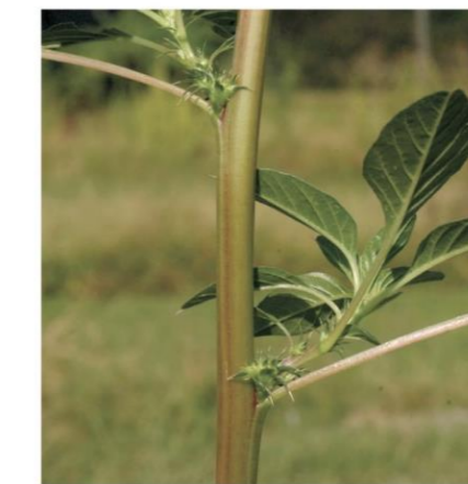
Palmer amaranth hairless stem