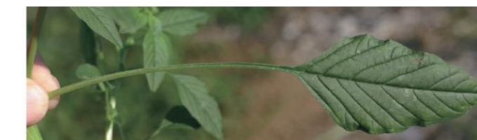
Palmer amaranth petiole equal to or longer than leaf blade