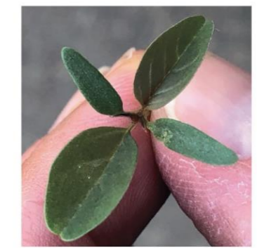
Palmer amaranth seedling L. Sosnoskie