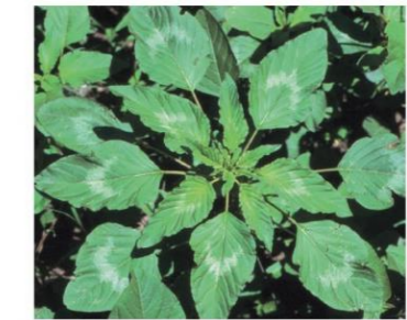
Palmer amaranth young foliage with chevron