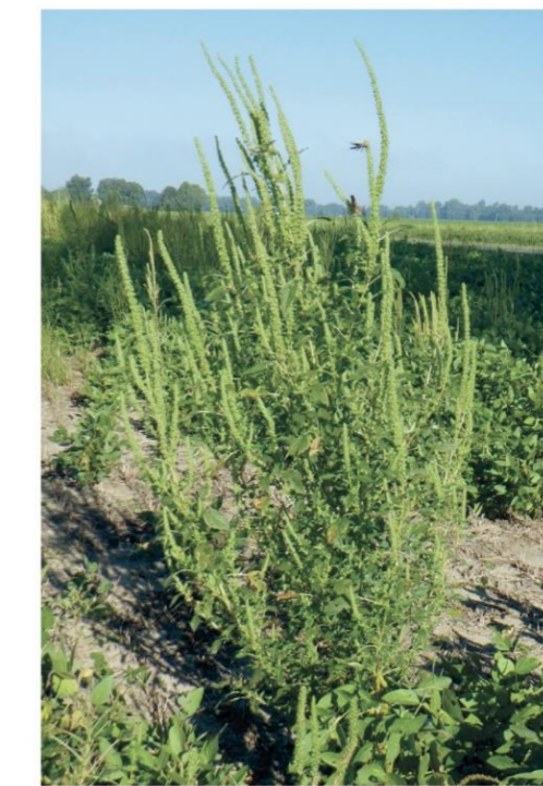
Palmer amaranth habit